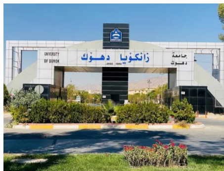
Figure 4.1 You can left justify your figures.

Figures should be In Line within the text , with their numbering reflecting the current chapter followed by a sequential number. You can copy the Figure 4.1 to another section and modify the figure and its caption as needed. The figure number will update automatically. If it does not, right-click the figure number and select “Update” to refresh it.